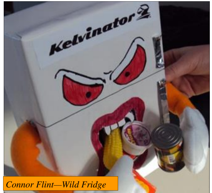
Connor Flint—Wild Fridge